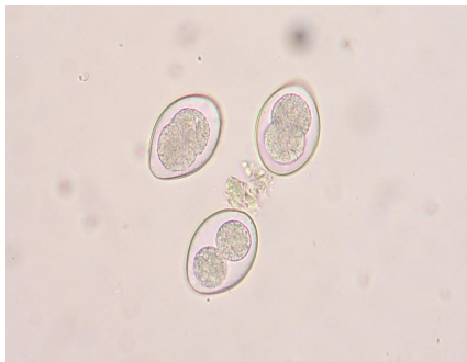
Coccidia (only visible microscopically)