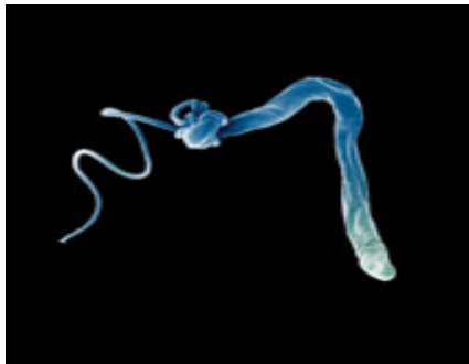
Whipworm (only visible microscopically)