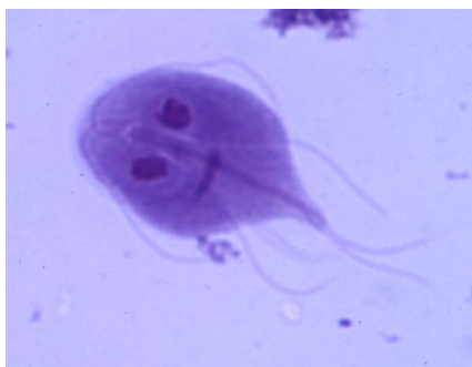
Giardia (only visible microscopically)