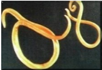
Roundworm (long, spaghetti-like)

Some of the parasites may be visible in your pets stool: