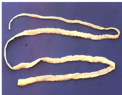
Tapeworm (long, fettuccini-like (whole) or segmented rice-like (individual segments))